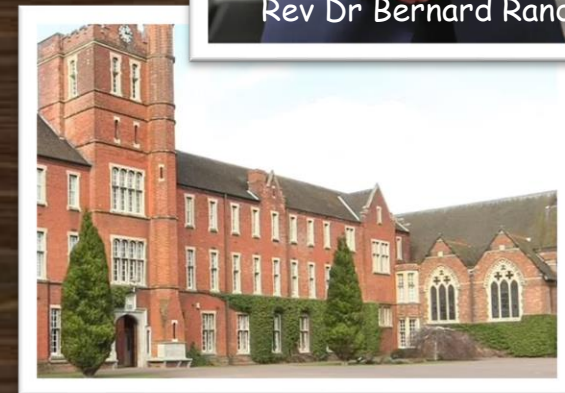
The school where he was a chaplain