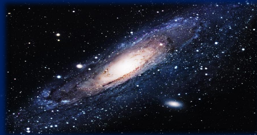
M31: The Andromeda Galaxy

Genesis 1:31 - God saw all that he had made, and it was very good.