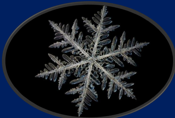
A snowflake under a microscope